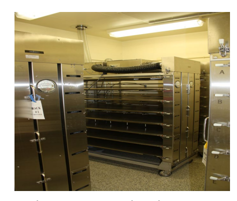
Rodent caging and racks