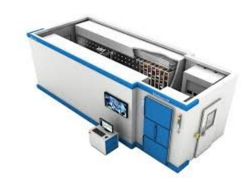
Robotic sample retrieval and storage system