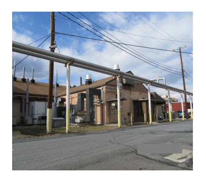
Above ground utilities

Depend upon the US Army Garrison for repair of utilities