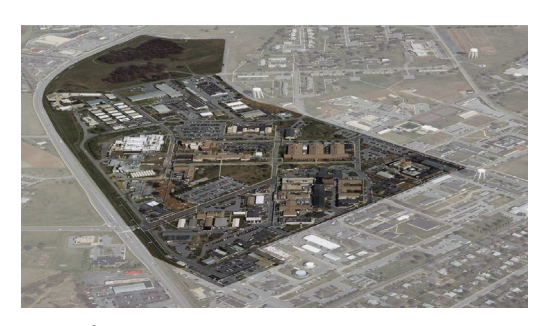
Aerial campus view