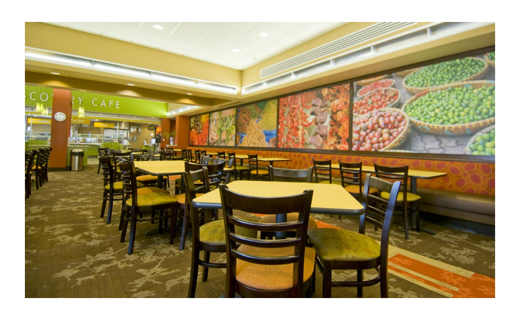
<u>Dinning hall / cafeteria</u>