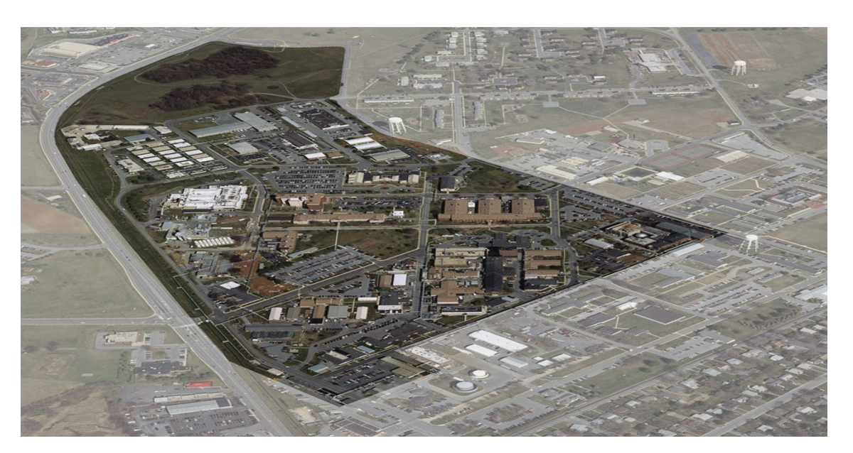
Aerial campus view