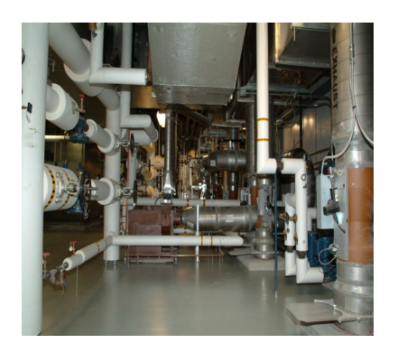
<u>Building attic mechanical piping and</u> exhaust infrastructure