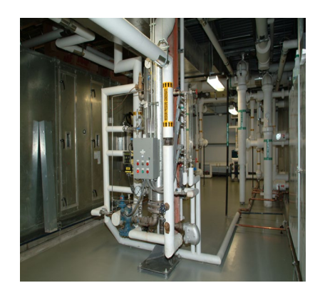
<u>Building attic mechanical HVAC air</u> handler infrastructure