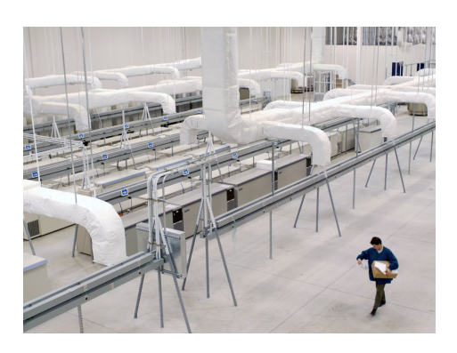
Liquid Nitrogen tanks and repository infrastructure