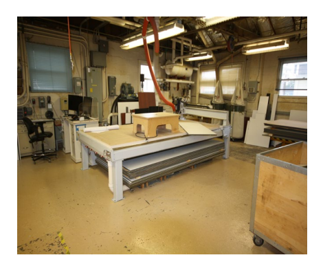
Facilities support shop space. Infrastructure and industrial equipment exists to meet scientific and laboratory needs