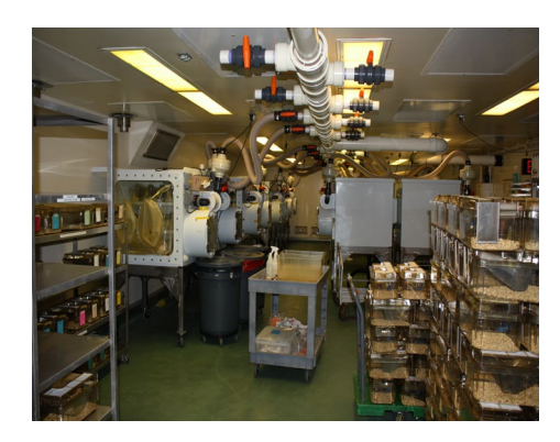
Animal facility cage and preparation room