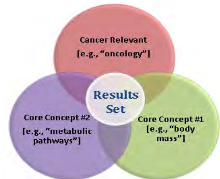
Figure 2. Illustration of keyword approach to identify relevant publications.

Methods. We measured the volume of relevant research through a keyword-based literature and grant search that mimics a manual approach taken to address this question. Articles were considered relevant if they met the following criteria: (1) they used keywords indicating cancer relevance; (2) at least one term from two separate lists was present to ensure that different attributes of the PQ question area were generally addressed; and (3) a composite score based on keyword match statistics was found to be above a threshold set by a manual review of over 200 sample results.