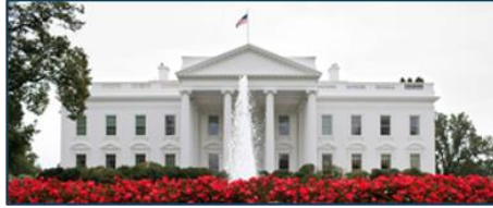
Vice President's Office