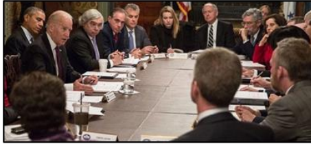
Federal Task Force