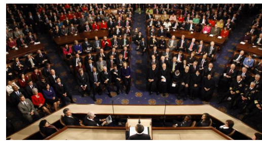
2016 State of the Union Address