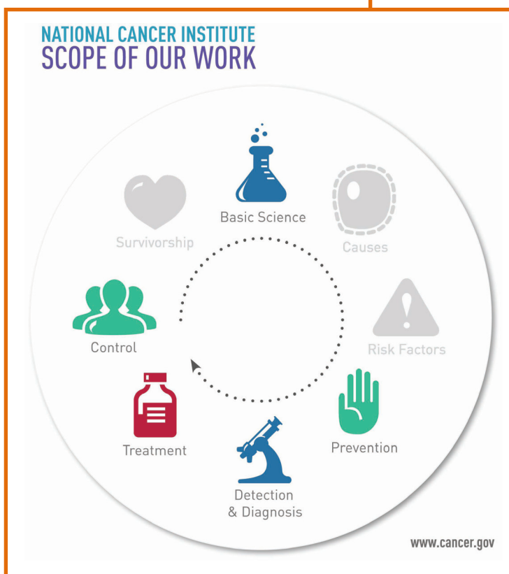
Figure 1. Graphical depiction of NCI Alliance for Nanotechnology in Cancer research areas (colored only) relative to the overall NCI priority areas.

The primary purpose of the Cancer Nanotechnology Plan 2015 is to serve as a strategic document to the NCI Alliance for Nanotechnology in Cancer as well as a guiding document to the cancer nanotechnology and oncology fields, as a whole. Now in its third incarnation, this CaNanoPlan 2015 has increased in scope, mostly, due to the fact that the field has significantly matured and expanded over the last decade. It includes contributions from researchers, clinicians, policy makers, and industrial experts in order to give a broad perspective on where the field is now and where it is heading in the future.