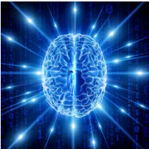
Illustration of brain

or an existing device with preliminary data at the award start to demonstrate its potential to achieve low cost, and for diagnostic devices the potential to serve as point-of-care tools with fast detection and accuracy. After implementation, proposed projects are expected to provide tools that are comparable to currently established technologies. Additionally, because of the nature of the award and purpose of the initiative, projects were required to establish multidisciplinary teams with expertise in oncology, global health care delivery, business development, and engineering to increase their potential success. NCI expects to fund up to six awards for the exploratory, UH2 phase. The amount of funds available is $3 million total for this first year.