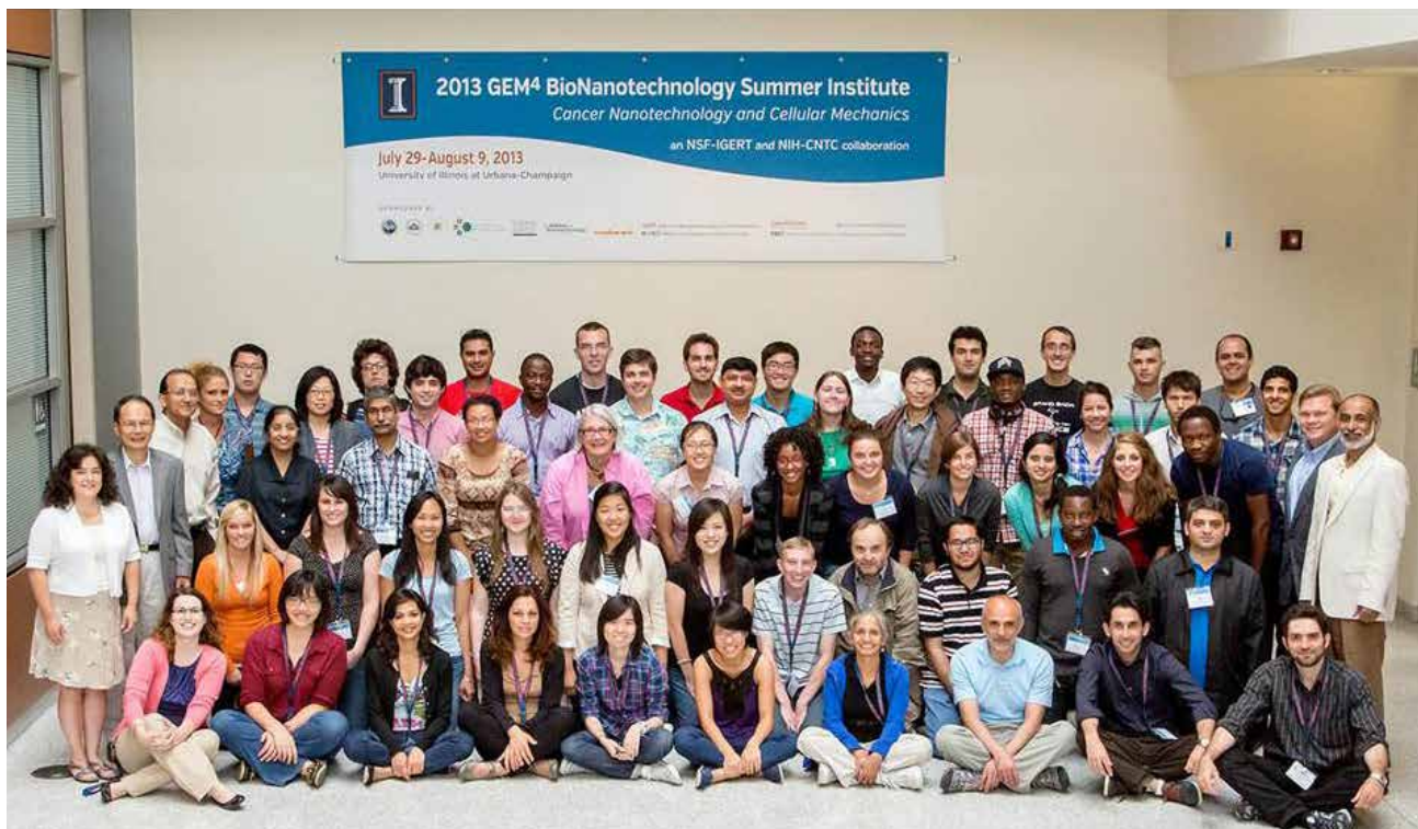
2013 GEM4 BioNanotechnology Summer Institute. Faculty, graduate students, and researchers representing 18 international and domestic universities that participated in the 2013 Summer Institute at the University of Illinois at Urbana-Champaign July 29-August 9, 2013. Attendees participated in lectures and hands-on training in engineering and physical science laboratory techniques taught by experts in the field. For more information, go to http://www.nano.illinois.edu/BioNano2013.