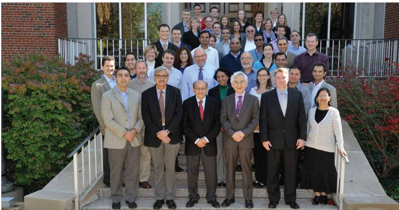
Participants in the Alliance-hosted TONIC Workshop on Enhanced Permeability and Retention (EPR) Effect, NIH Bethesda Campus October 2012.