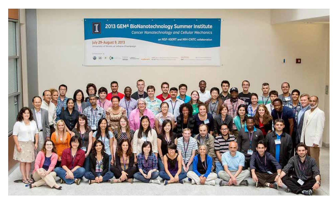
2013 GEM4 Bionanotechnology Summer Institute. Faculty, graduate students, and researchers representing 18 international and domestic universities that participated in the 2013 Summer Institute at the University of Illinois at Urbana-Champaign July 29-August 9, 2013. Attendees participated in lectures and handson training in engineering and physical science laboratory techniques taught by experts in the field. For more information, go to http://www.nano.illinois.edu/ BioNano2013.