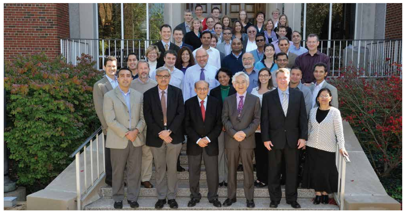
Participants in the Alliance-hosted TONIC Workshop on Enhanced Permeability and Retention (EPR) Effect, NIH Bethesda Campus October 2012.